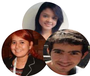
Baranquilla+20 – Environmental Justice, Colombia