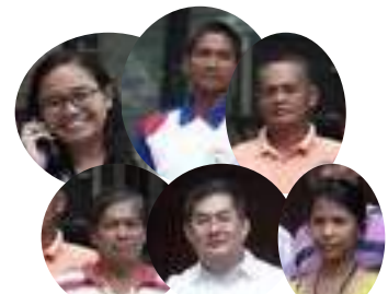
Task Force ANTI APECO —Indigenous Peoples Rights, Philippines