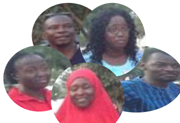
Bring Back Our Girls – Anti-Terrorism + Accountability, Nigeria